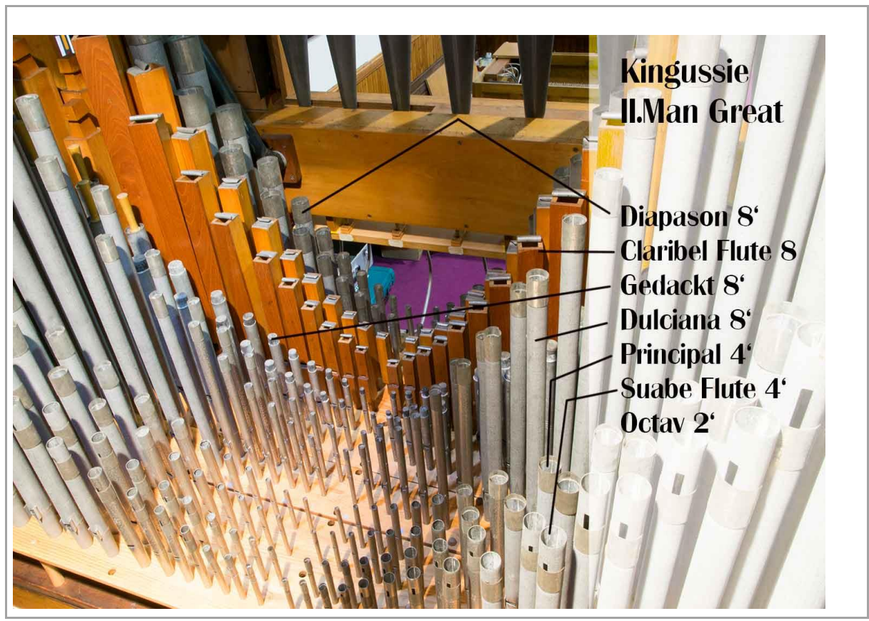
This presentation can found on our website too but with better solution of pictures on: <a href="http://walcker.com">http://walcker.com</a>

By the use of the couplers, 450 pipes can be played with 10 fingers. This requires a high and precise wind pressure. The pipes have different shapes and therefore differentiated sound design. The pipework of the two manuals is shown on the following two pages.